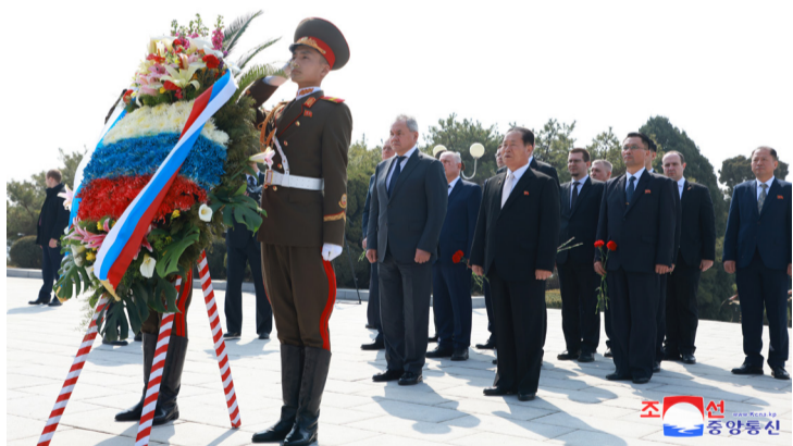
The delegation of the Security Council of the Russian Federation led by Secretary Sergei Shoigu lays a wreath at the Liberation Tower in Pyongyang on March 21.