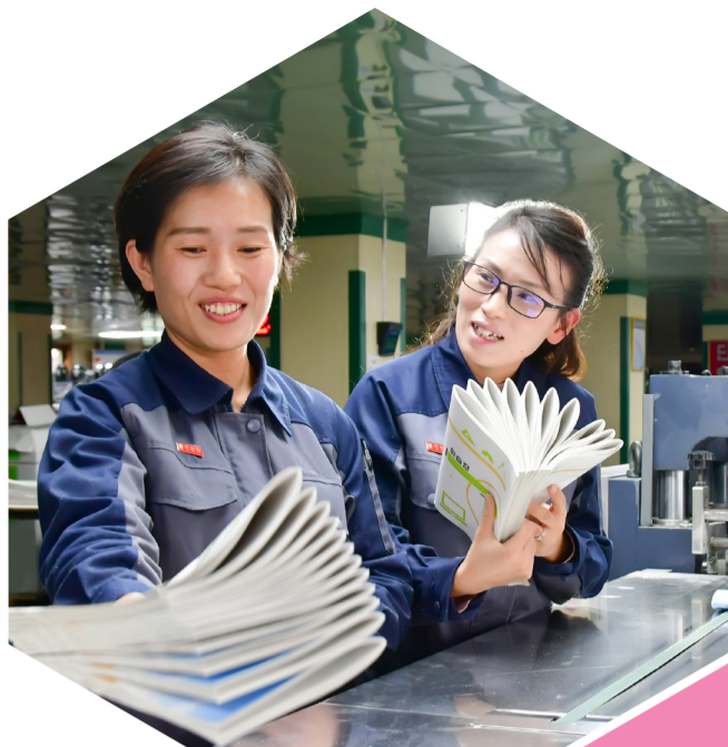
At the Mindulle Notebook Factory.

The officials and employees of the factory continue to expand successes in production with greater enthusiasm for competition between workshops and workteams.