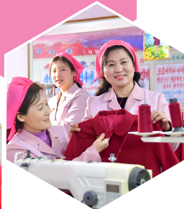
At the Pyongyang School Uniform Factory.