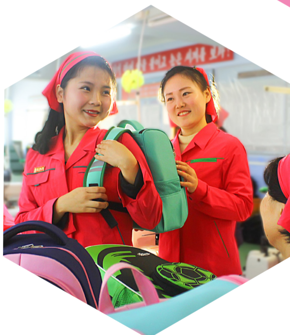
At the Pyongyang Bag Factory.

Working people across the country produce essential goods for students with sincerity